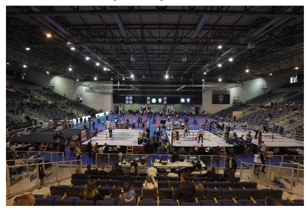
PALAINVENT Address: Piazza Brescia 11, 30016 JESOLO LIDO (VENICE) - ITALY Web site: http://www.palazzodelturismo.it/

WC HQ for Registration, Weigh in and Medical control