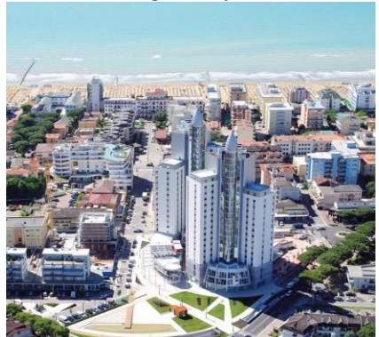
The area features modern facilities tailored ample parking.