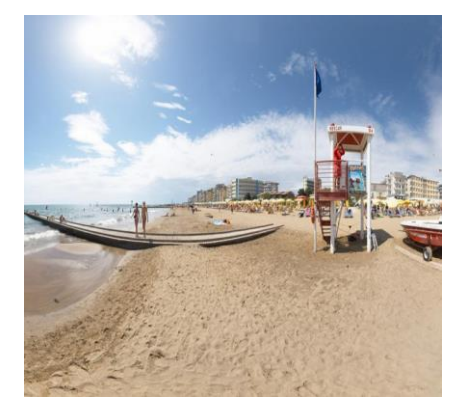
to the needs of its guests and provides

Fifteen kilometres of golden beach and twelve kilometres of Jesolo's pedestrian walkways, the longest in Europe rub along the coast. The numerous squares are the meeting place for enjoying music and events in a pleasant atmosphere.